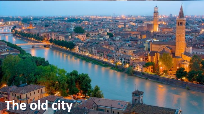
The old city