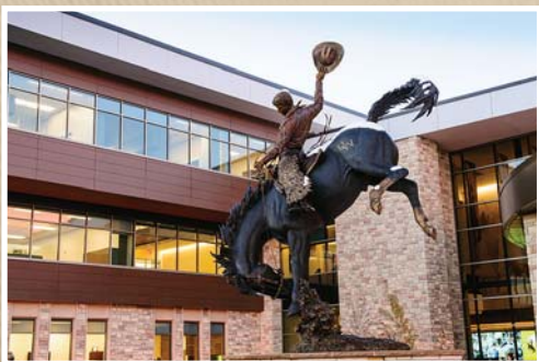
Marian H. Rochelle Gateway Center