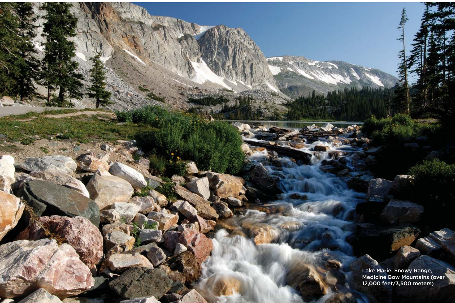
Lake Marie, Snowy Range, Medicine Bow Mountains (over 12,000 feet/3,500 meters)