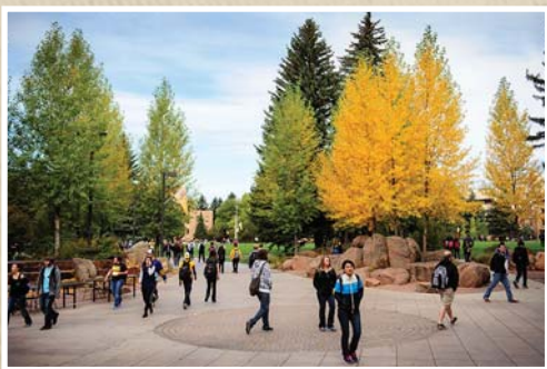
Prexy's Pasture, UW Campus